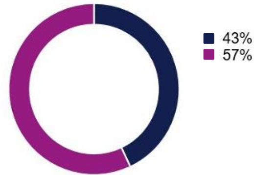
Upper Middle Quartile